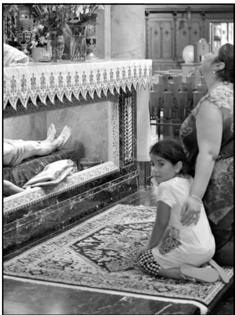
Children as well as adults ask for Our Lady's help.

We also look forward to meeting the many school, youth and young adult groups that come to the Shrine. Recalling Jesus' instruction to the disciples, "let the children come to me," we are happy to receive first communion and grade school students on class trips and share the Shrine's living testimony of faith with them.