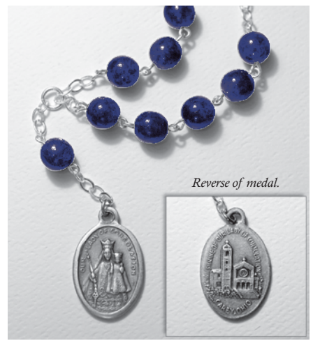
Reverse of medal.