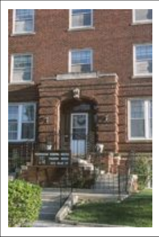
The Retreat House

time, and many kneelers were added or fixed. The Lower Basilica looks like it has received a nice facelift, yet it retains all its familiarity from over a century of usage.