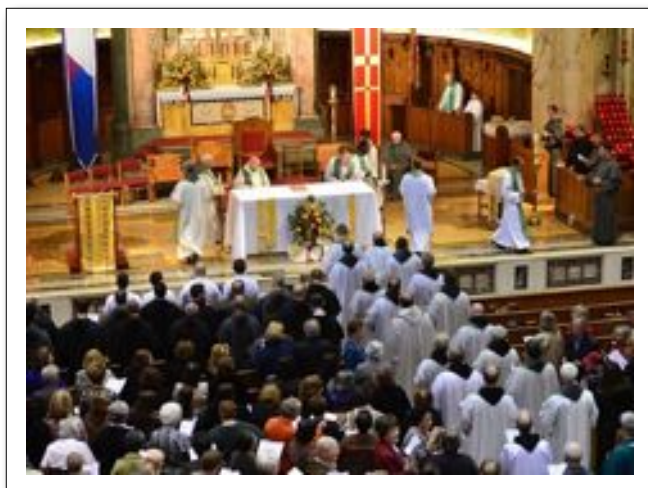
Mass is celebrated at Our Lady of Consolation

Just as the friars were winding down the celebrations of one hundred years of presence and