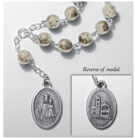
Reverse of medal.