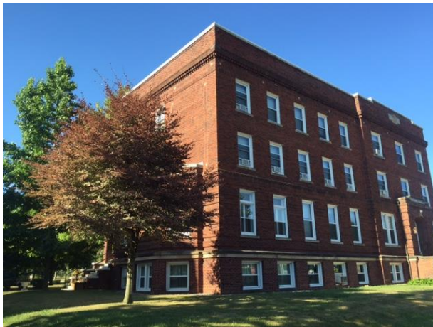
Our Lady of Consolation Retreat House

Basilica and National Shrine of Our Lady of Consolation 315 Clay Street