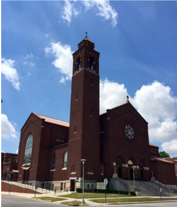
The Basilica and National Shrine of Our Lady of Consolation