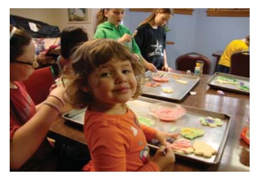
Look mom, see what I can do!