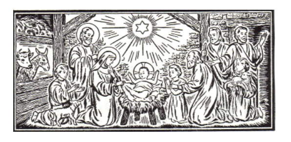
"For to us a child is born To us a Son is given"